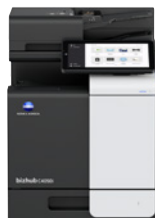
bizhub i-Series C4050i

So as your business grows, we will grow with you – seamlessly linking people and places to give a new dimension to document workflow and security management.