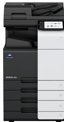
bizhub i-Series C360i