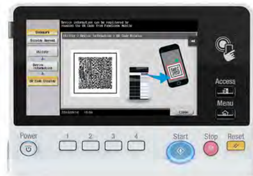
QR code display screen