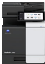
bizhub i-Series C4050i

So as your business grows, we will grow with you – seamlessly linking people and places to give a new dimension to document workflow and security management.